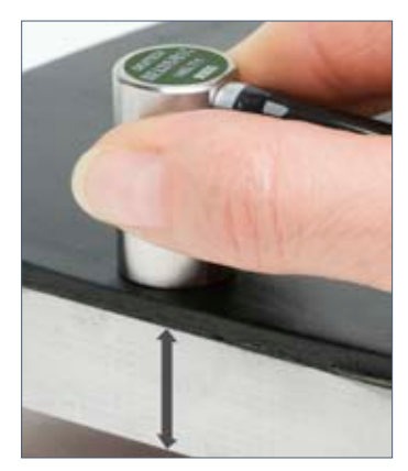
Measurement also through coatings