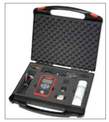
Delivery in a handy carrying case