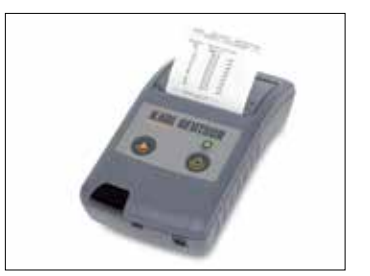
Mobile thermal printer