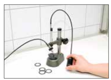
Probe positioning device