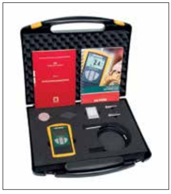
Practical carrying case provides enough space for extensive accessories