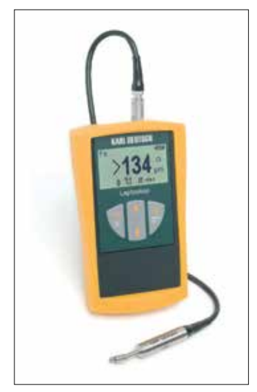
The LEPTOSKOP 2042: high-performance, up-to-date, affordable