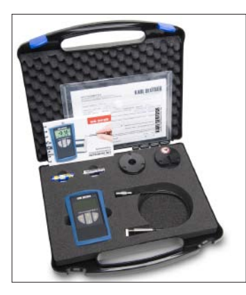
Delivery in a handy carrying case together with a detailed instruction manual and a quality test certificate (image shows sample assembly).